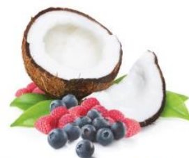
Unsweetened Gluten Free Berry Coconut Granola