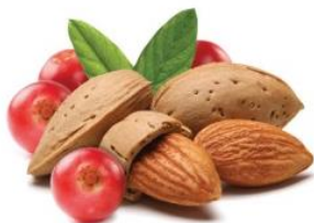
Cranberry Almond Granola Clusters