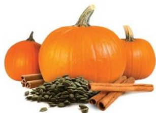
Gluten Free Pumpkin Spice Granola Clusters