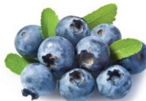
Protein Blueberry Harvest Granola